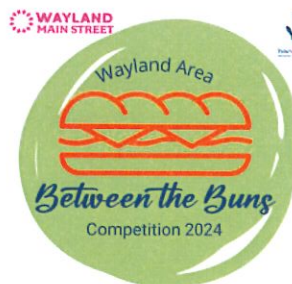
Between the Buns

Everybody's Irish - Come downtown Wayland on March 15th from 2pm to 7pm to enjoy a family friendly St. Patrick's Day event! There will be music, vendors, and