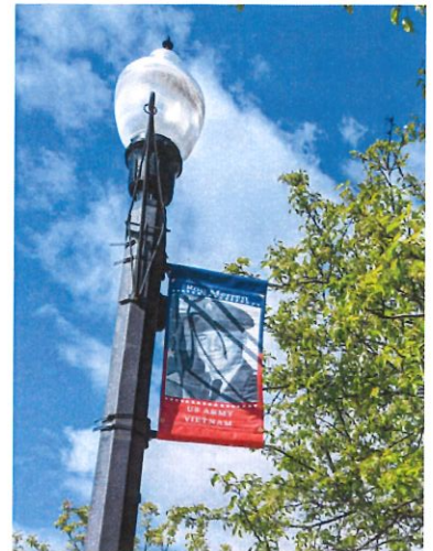
Wayland Veteran Banners

Note: If you purchased a banner last year and DID NOT pick it up, you do not need to buy a new one. We will rehang yours. If you picked up your banner, you will need to order a new one or drop yours off by March 1st, 2025.