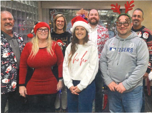
The Wayland City Council wishes you and your family a happy and safe holiday season!